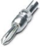
Test plugs, Color: silver