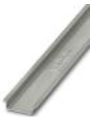
DIN rail, material: Aluminum, unperforated, height 7.5 mm, width 35 mm, length: 2 m

DIN rail - NS 35/ 7,5 AL UNPERF 2000MM - 0801704