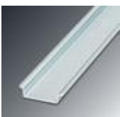
DIN rail, material: Galvanized, unperforated, height 7.5 mm, width 35 mm, length: 2 m

DIN rail - NS 35/ 7,5 ZN UNPERF 2000MM - 1206434