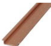
DIN rail, material: Copper, unperforated, height 7.5 mm, width 35 mm, length: 2 m

DIN rail - NS 35/ 7,5 CU UNPERF 2000MM - 0801762