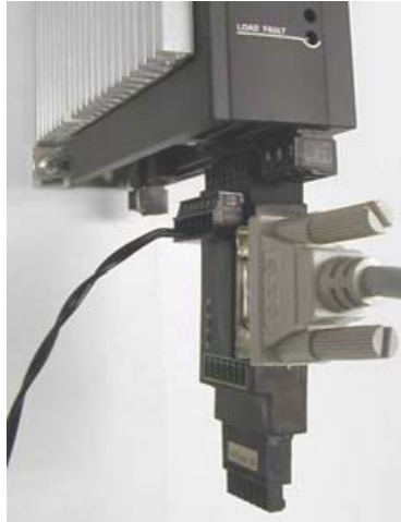
FIG. 1 THYRO-S

The connection of the interface at Thyro-S corresponds to fig. 1. Then the free upper 7-pin row is intended for the plug that was before on the connection present (set point wiring). The plug is to put directly below the Thyro-S from left side on to the interface.