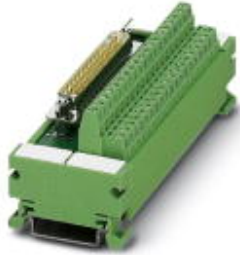
VARIOFACE module, with screw connection and D-subminiature pin strip, for assembly on NS 35/7.5, 37 positions

Please be informed that the data shown in this PDF Document is generated from our Online Catalog. Please find the complete data in the user's documentation. Our General Terms of Use for Downloads are valid ( http://download.phoenixcontact.com )