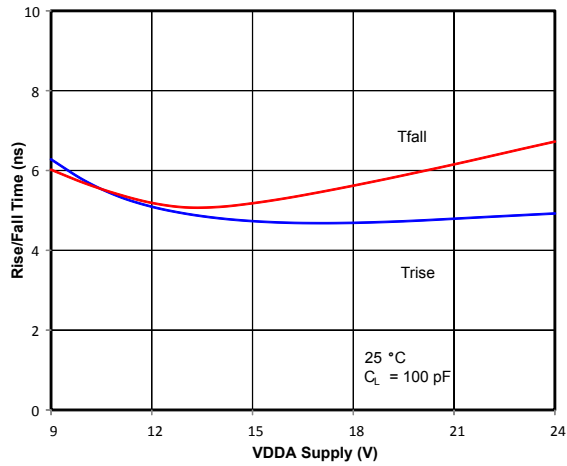
Figure 2.6. Rise/Fall Time vs. Supply Voltage

The typical performance characteristics depicted in Figure 2.6 Rise/Fall Time vs. Supply Voltage on page 11 through Figure 2.15 Output Source Current vs. Temperature on page 12 are for information purposes only. Refer to Table 3.1 Electrical Characteristics 1 on page 24 for actual specification limits.