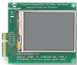
Graphics Display 3.2" 320 × 320 Board (AC164127-4)