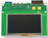
Multimedia Expansion Board II (DM320005-2)

The Multimedia Expansion Board II (MEB II) is a highly integrated, compact and flexible development platform which works with PIC32MZ Starter Kit. The MEB II kit features a 4.3" WQVGA PCAP touch display daughter board. The kit also has an on-board 24-bit stereo audio codec, VGA camera, 802.11 b/g wireless module, Bluetooth® HCI transceiver, temperature sensor, microSD™ slot and analog accelerometer.