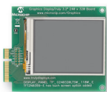
Graphics Display 3.2" 320 x 320 Board (AC164127-4)