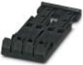
Strain relief, Number of positions: 4, Color: black