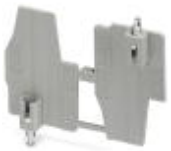
Flange cover, Length: 45.7 mm, Width: 4.5 mm, Height: 32 mm, Color: gray