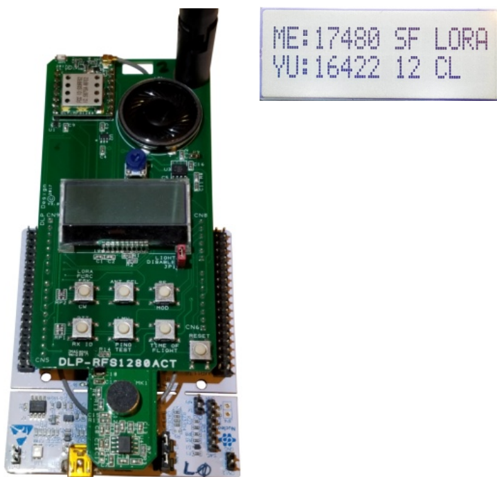
DLP-RFS1280ACT DEMONSTRATION PLATFORM (Serving as a Target for this demonstration)

The system is set up and ready for this demonstration once all Target transceivers are powered and set to LORA Mode. If a Target is set to GFSK or FLRC Mode, simply press Button 1 until “LORA” is shown in the display: