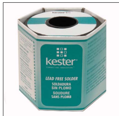
"275" No-Clean Core 1 lb. with K100LD