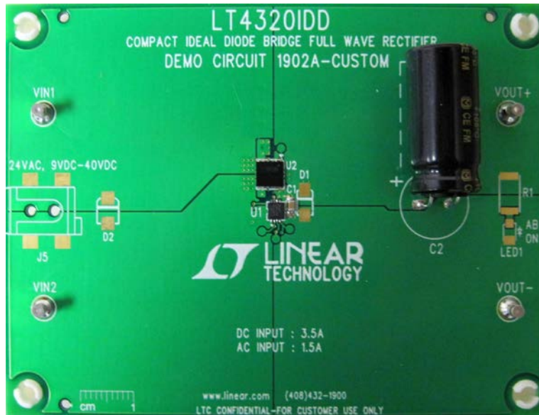
Figure 4. Demonstration Circuit 1902A Used in Figure 3 Thermograph