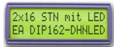
EA DIP162-DHNLED 68 x 27 x 11 mm