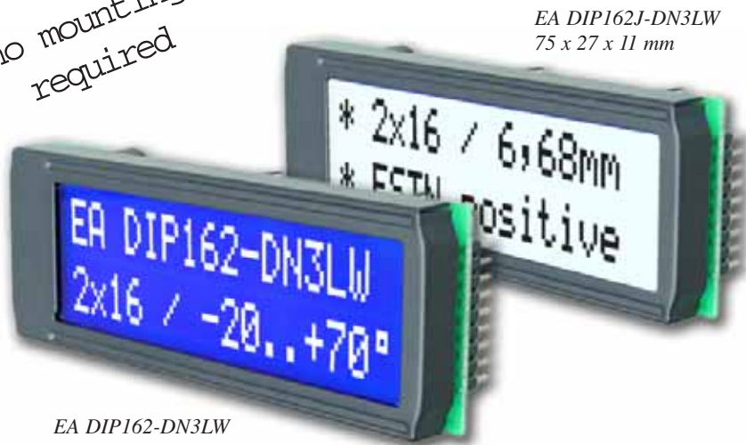
EA DIP162J-DN3LW 75 x 27 x 11 mm