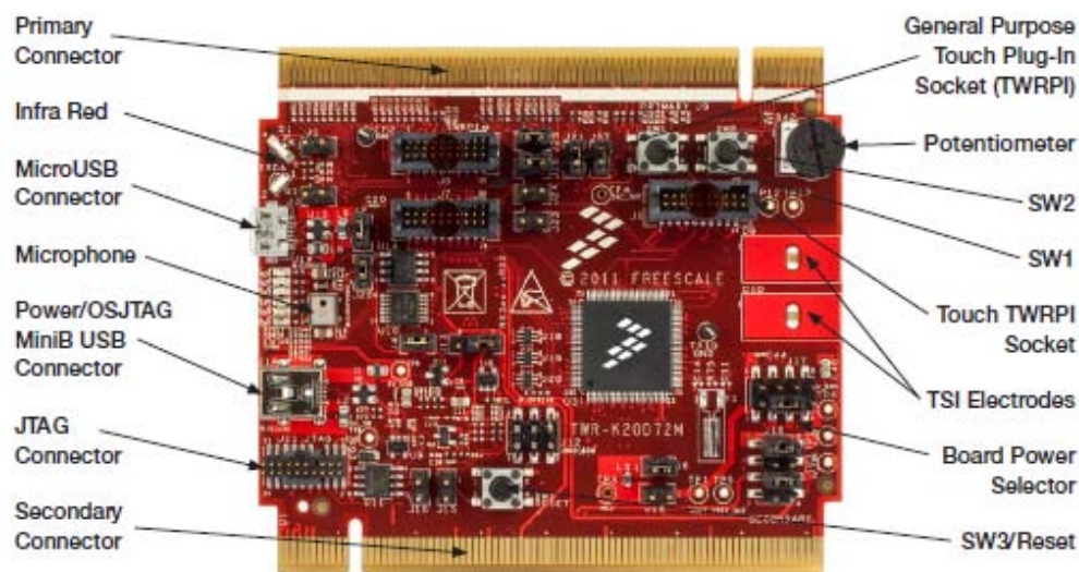
Figure 1. Front side of TWR-K20D72M module