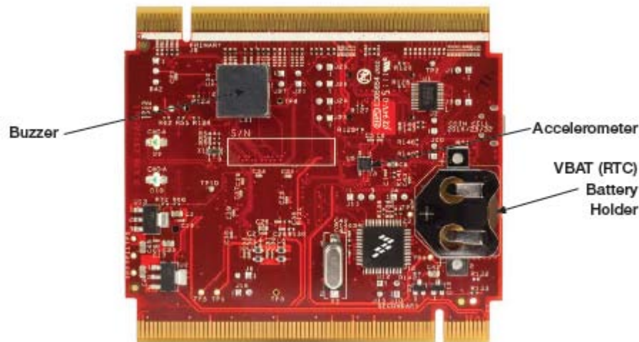
Figure 2. Back side of TWR-K20D72M module