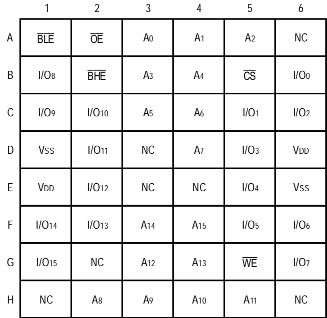
FBGA (BF48-1) Top View