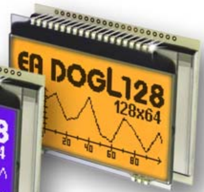
EA DOGL128W-6 + EA LED68x51-A