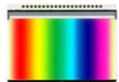
EA LED68x51-RGB Full Color

http://www.lcd-module.de/eng/pdf/grafik/dogl128-6e.pdf