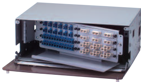
AX100115 FiberExpress (4U) Rack Mount Patch Panel