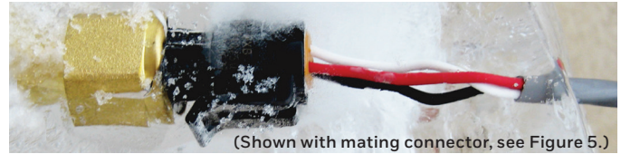
Figure 2. PX3 Series External Freeze/Thaw Resistance