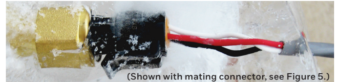
Figure 2. PX3 Series External Freeze/Thaw Resistance