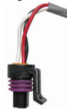
Mating Connector 2