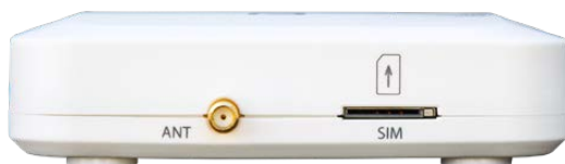
DIGI CONNECT IT MINI LEFT