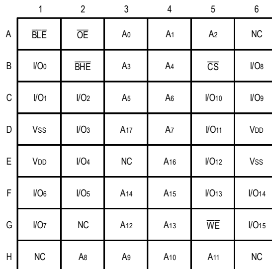
3624 tbl 11