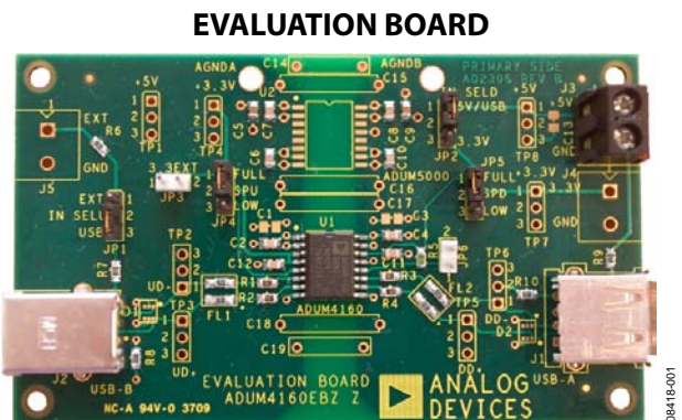
Figure 1. USB Evaluation Board

The evaluation board allows configuration of all of the features of the ADuM4160/ADuM3160 chip and provides support for a variety of possible power schemes. The board also allows common-mode voltages; however, it is not recommended for performing safety related testing, such as high voltage withstand testing. Perform this type of testing on the component level or on a production board.