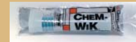
PermaPak™ Barrier Packaging contains 25 bobbins per package