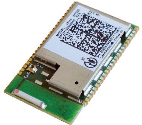
*XPC W1003 version shown

As an innovative, mobile ready solution, the Lantronix® xPico® Wi-Fi® SMT device server sets new standards for its customers by enabling IoT applications that deliver highly desired smartphone and tablet functionality. Once complex, now Wi-Fi implementation is greatly simplified with xPico Wi-Fi SMT's unique and robust feature set including; simultaneous Soft AP and client mode, zero host load, and configuration by customization. These along with Lantronix' commitment to reliability, quality and ease of use, supports developers to quickly leverage mobile solutions for their applications, while reducing their total cost of ownership across their products life cycle.