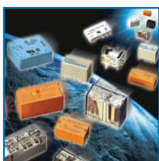
Schrack PCB Relays