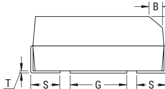
ANODE (+) END VIEW