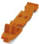
Latching, Width: 5.2 mm, Length: 3 mm, Number of positions: 2, Color: orange