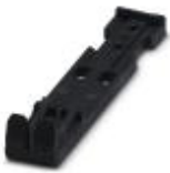
Strain relief, Number of positions: 2, Color: black