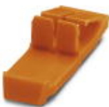
Latching, Number of positions: 2, Color: orange