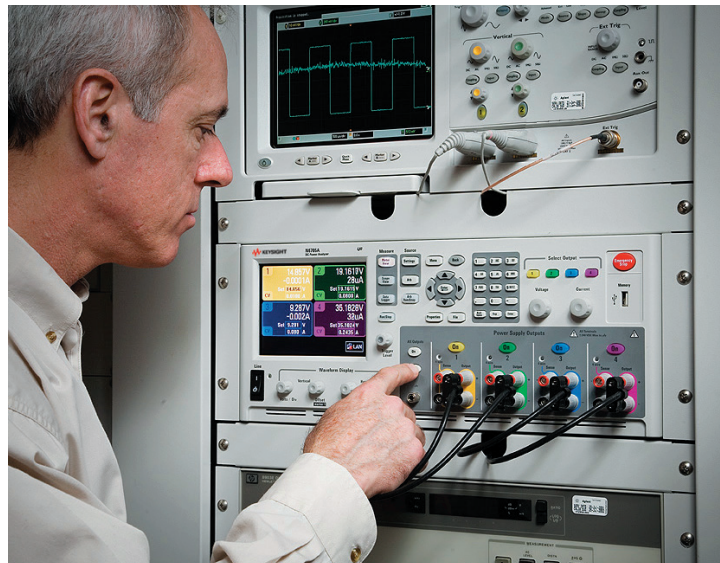
Figure 14. The Keysight N6705 can be installed in a standard 19 inch rack.

The Keysight N6705 has a universal input that operates from 100-240 VAC, 50/60/400 Hz. There are no switches to set or fuses to change when switching from one voltage standard to another. The AC input employs power factor correction.