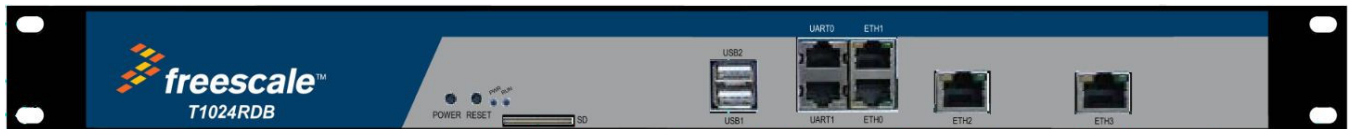
Figure 1. T1024RDB serial ports location

The figure below shows the UART serial port of the T1024RDB-PC.