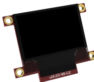
The uOLED-96-G2 Display Module

NOTE (*): Arduino remains the property of the Arduino Team. All references to the word Arduino and Arduino Hardware are licensed under the Creative Commons Attribution Share-Alike license.