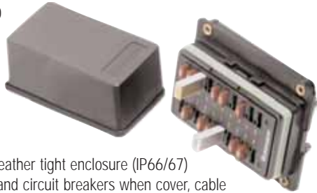
Shown with deep cover. Fuses and circuit breakers sold separately.

The RTMF offers a weather tight enclosure (IP66/67) for ATM blade fuses and circuit breakers when cover, cable seals, and cavity plugs are installed.*