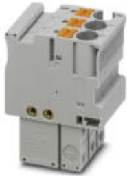
Plug, 3-pos. with integrated, automatic short circuit function

Please be informed that the data shown in this PDF Document is generated from our Online Catalog. Please find the complete data in the user's documentation. Our General Terms of Use for Downloads are valid ( http://download.phoenixcontact.com )