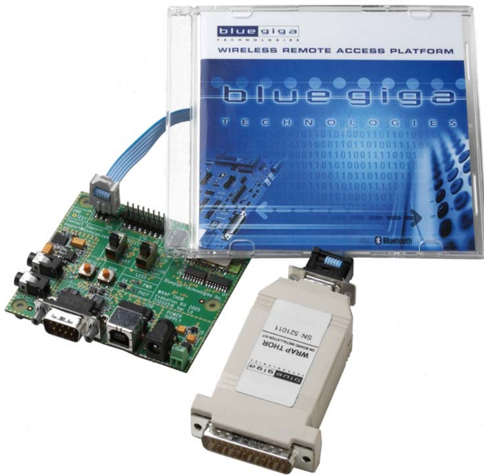
Figure 1: WT12 Evaluation Kit, Onboard Installation Kit and CD