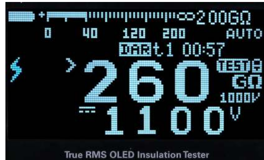
Figure 5. Adjustable insulation test voltage up to 1.1 kV

The adjustable insulation test voltage from 10 V to 1.1 kV in 1 V steps on selected two models 1 allows you to set precise test voltages catered to unique test application requirements. These typical applications are commercial avionics testing, military communications system testing and production line testing. The standard test voltages from 50 V to 1 kV is also available for selected models 2 .