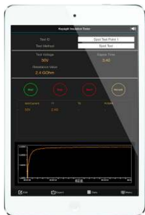
Figure 2. Perform remote testing with Keysight InsulationTester Application