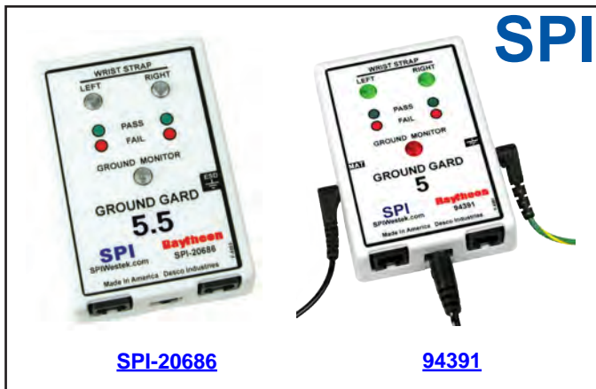
Figure 1. SPI Ground Gard items SPI-20686 and 94391